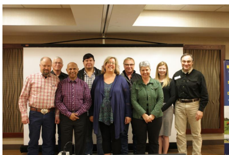
Fig 3. Your 2016-2017 AFIN Board of Directors