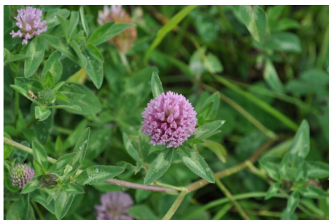
Fig 4. Red Clover Flower

2014 Interim Report 2015 Interim Report Alberta Insect Pest Monitoring Network Webpage